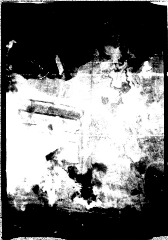
After German oil again, 306th bombs are seen hammering the highly productive plant at Bohlen. Capt. Ross, lead bombardier, did an excellent job of obliterating the briefed aiming point, seen just under the smoke in the picture.

367th A/C, pilot Lt. Bear, received such flak damage at target. Oxygen system was shot out and #2 engine lost its oil pressure, causing pilot to feather. A/C landed at Merville on the continent, and crew returned to base a few days later.